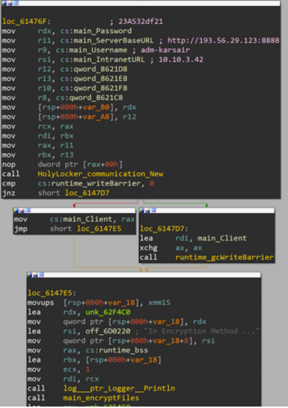
Figure 6. BTLC.exe C2 communication

Based on our investigation, the attackers frequently asked victims for anywhere from 1.2 to 5 Bitcoins. However, the attackers were usually willing to negotiate and, in some cases, lowered the price to less than one-third of the initial asking price. As of early July 2022, a review of the attackers' wallet transactions shows that they have not successfully extorted ransom payments from their victims.