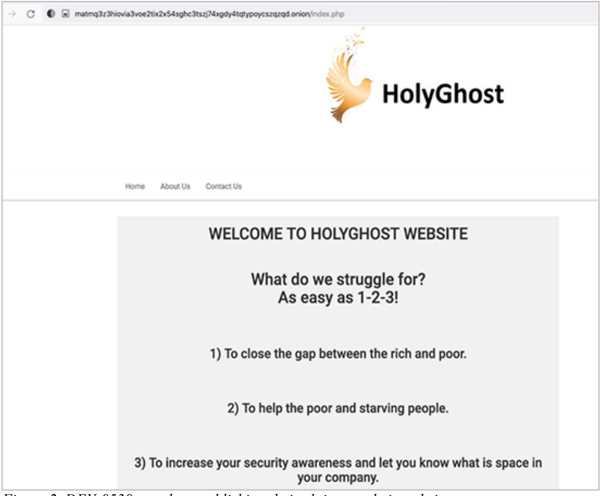
Figure 2. DEV-0530 attackers publishing their claims on their website.

Like many other ransomware actors, DEV-0530 notes on their website's privacy policy that they would not sell or publish their victim's data if they get paid. But if the victim fails to pay, they would publish everything. A contact form is also available for victims to get in touch with the attackers.