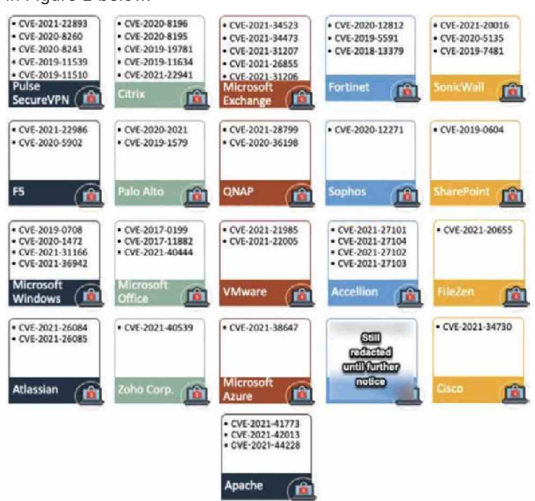
Figure 2: Vulnerabilities abused by ransomware actors

As mentioned in the case studies highlighted previously in this including the Log4Shell vulnerability, Microsoft's Exchange servers, and the Pulse Connect Secure VPN, among others listed in Figure 2 below.