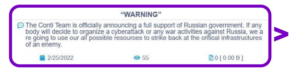
Exhibit 3: A February 26, 2022, posting by the Conti Team ransomware collective, showcasing its support for Russia and its willingness to target critical national infrastructure.

Clear examples of pro-Russian actors are members of the Conti Team (Exhibit 3) , LockBit and CoomingProject ransomware collectives publicly stating their support for the Russian government. However, taking a stance does have consequences—shortly after Conti Team's statement of support, the threat group suffered a devastating breach by a Ukrainian security researcher resulting in the disclosure of Conti Team's source code, tactics, techniques and procedures and internal group communications, causing LockBit actors to retract their support and claim apolitical neutrality, presumably to avoid similar dissent<sup>1</sup>. Similarly, RaidForums' main domain was seized by unknown entities shortly following that forum's statement of pro-Ukrainian support; this domain remains offline as of March 4, 2022.