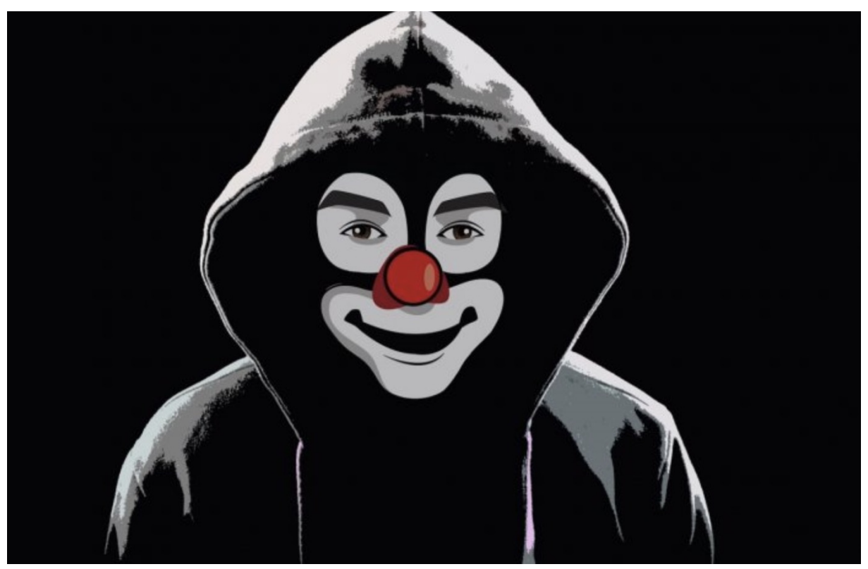
New Apostle variant wallpaper image

Other than the ransom demand note, the wallpaper picture used on affected machines was also changed, this time presenting an image of a clown: